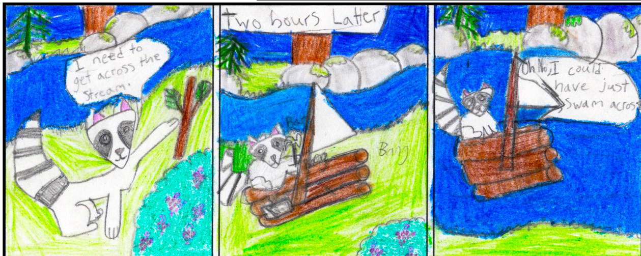
Comic by: HazelNut & Arayna